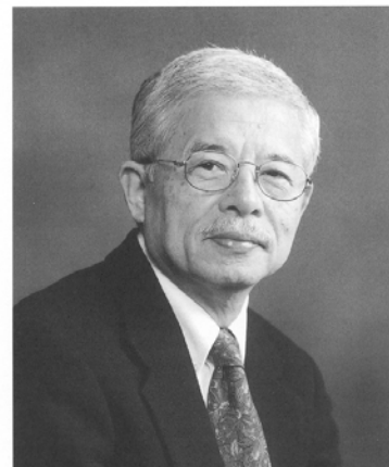
Professor Makoto Ohkusu

ics as the nonlinear behaviour of a long cable, a new evaluation method for the oscillating and translating Green function, and its application to the boundary-value problem for the flow around ships. In his last years before retirement from Kyushu University, he also worked on hydroelastic problems connected with very large floating structures to be used as floating airports.